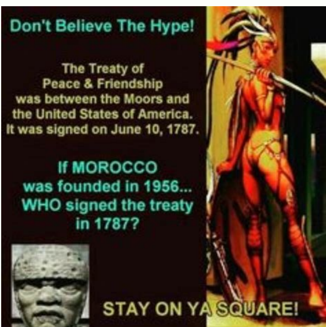
pinterest.com Taina Warrior Chief of Xaragua: Anacaona from Hispaniola/Haiti ... Board, Black Histness, Consciousness, Spirituality, African, Knowledge, Sign